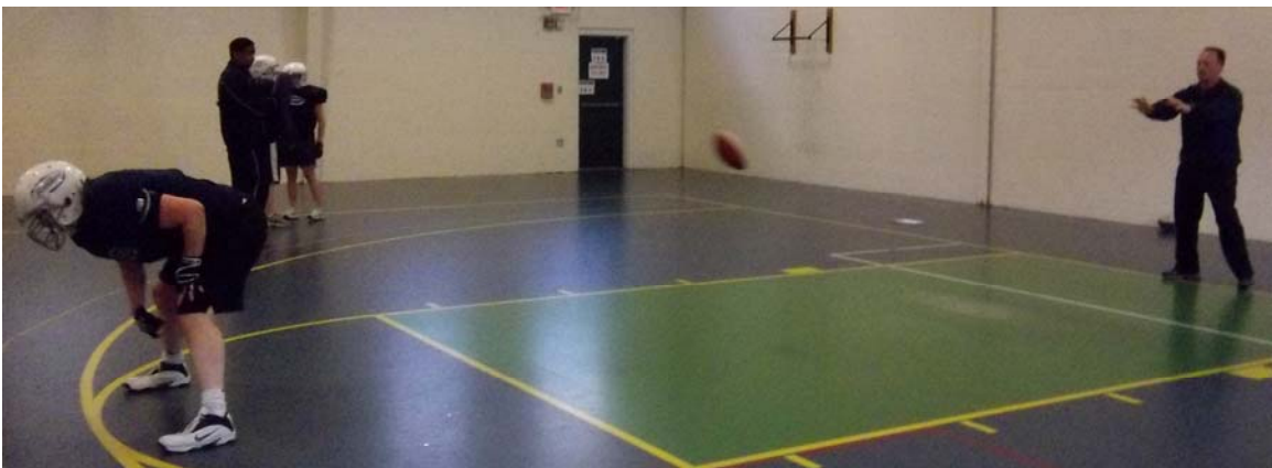
Maia long snapping.