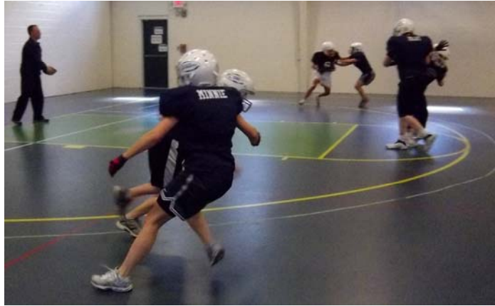
Special teams drills for the gunners.