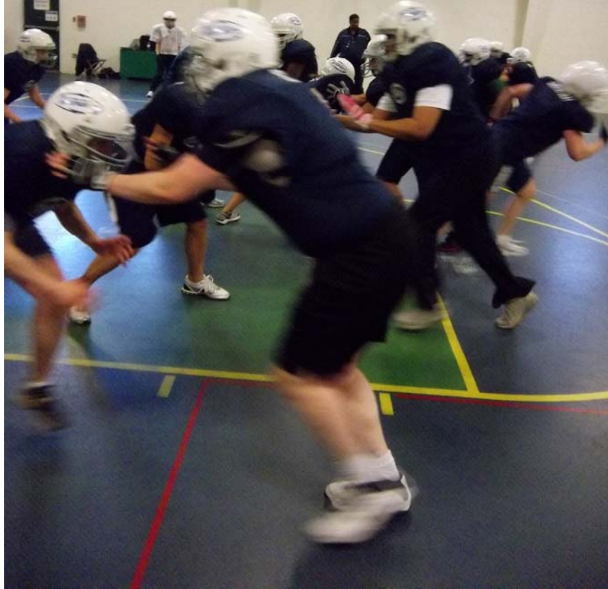
The Meat in action on special teams.