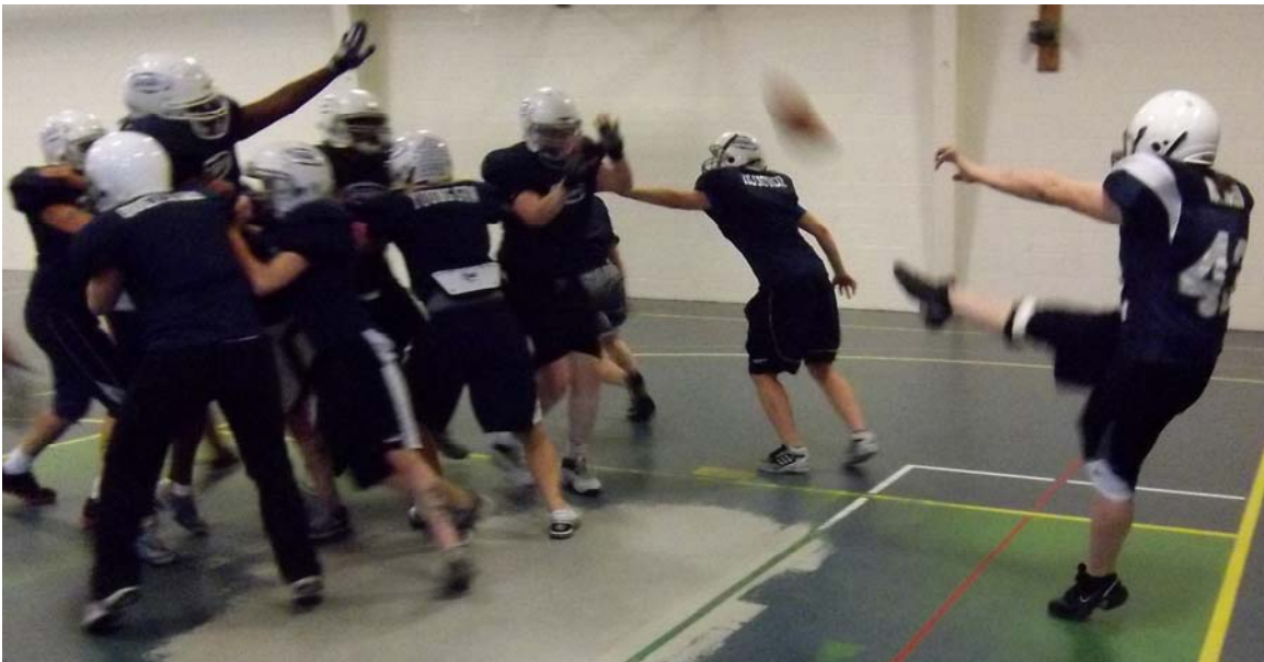
Riss mid-punt, with Coco trying to block it.